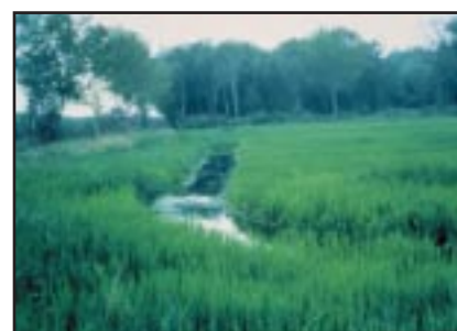
Figure 1. Cultivated forage crawfish pond.

May/June: Drain pond and repeat cycle without restocking crawfish.