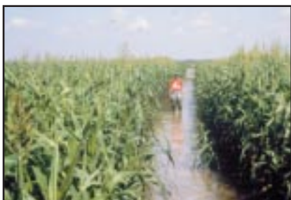
Figure 3. Sorghum-sudangrass as forage in crawfish pond.

Sorghum-sudangrass. Good rice stands may be difficult to achieve in some geographical regions and under some environmental conditions, especially during late summer in the southern U.S. Other forage crops, such as sorghum-sudangrass hybrid ( Sorghum bicolor ), may be a good alternative for crawfish forage (Fig. 3).